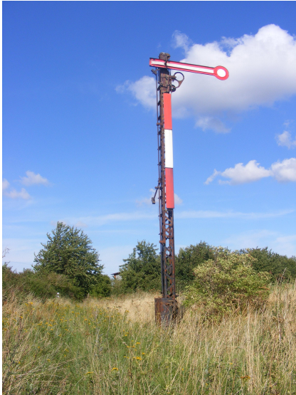
(Ger.) Signalmast, Formsignal